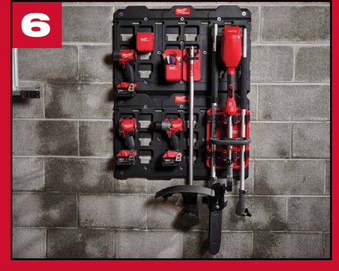
Repeat process to add additional plates and fully customize your shop.

*Certain concrete materials may require longer anchors