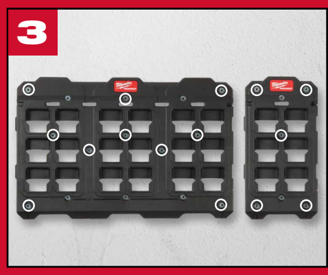
If using a Large Wall Plate, mark the 10 identified fastening points with a pencil. If using a Compact Wall Plate, mark the 5 identified fastening points.