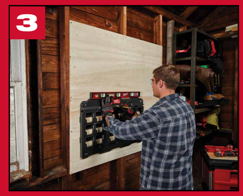
Hold Wall Plate in desired location. Ensure plate is level.