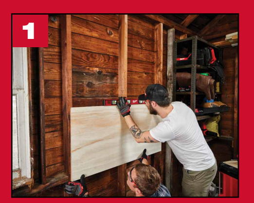
Have a partner hold up plywood backer in desired location and align it so it is in the center of a stud. Ensure plywood is level.