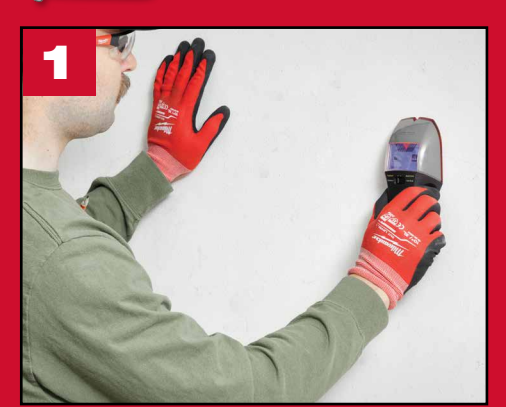
Locate & mark studs behind drywall with a pencil.