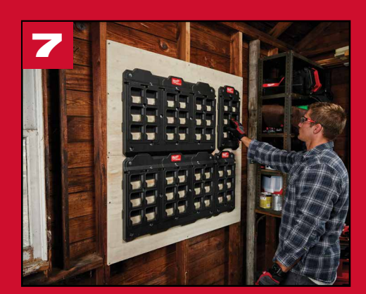
Slide additional Wall Plates into place by guiding the new plate's Quick Adjustment Tabs on the top, bottom, or sides into place on the first Wall Mounted Plate.