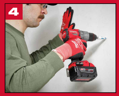
Follow drywall anchor manufacturer's instructions to install anchors. For any markings that fall on studs pre-drill holes with a 3/32" drill bit.