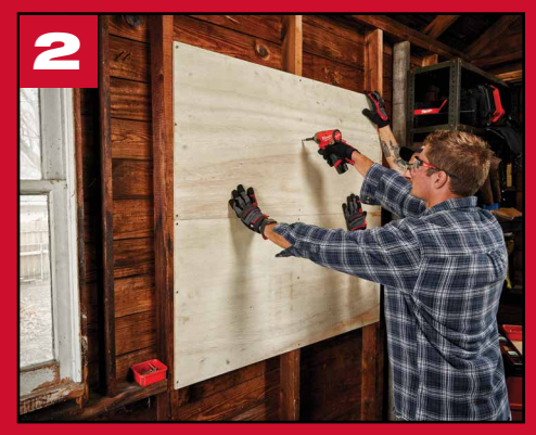
Attach plywood to studs with a minimum of 9 wood screws.