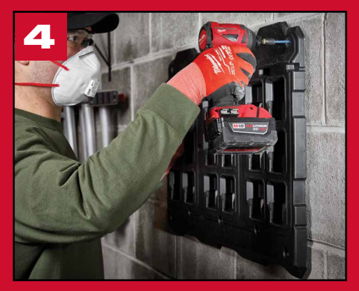
Using 1/4" x 1-1/4" concrete anchors, fasten the plate to the wall.