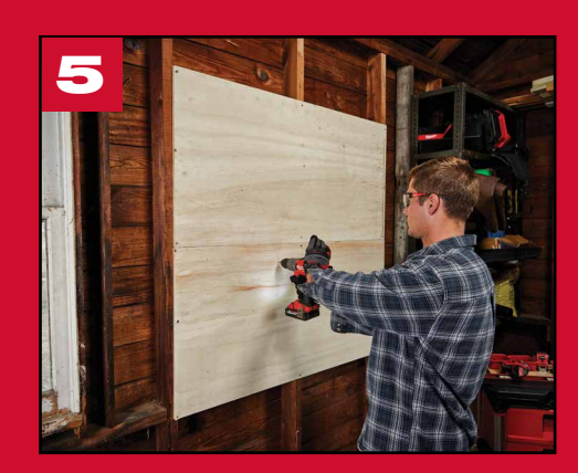
Pre-drill all mounting holes with a 3/32" bit.