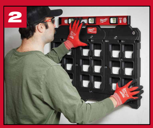
Hold Wall Plate in desired location. Ensure plate is level.