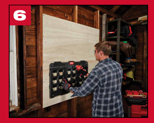
Hold up plate and fasten with 1/4" x 1-1/4" lag bolts.