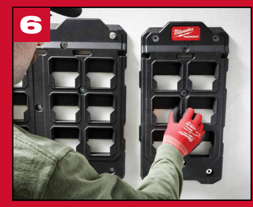
Slide additional Wall Plates into place by guiding the new plate's Quick Alignment Tabs on the top, bottom or sides into place on the first Wall Mounted plate.