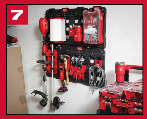
Repeat process to add additional plates and fully customize your shop.