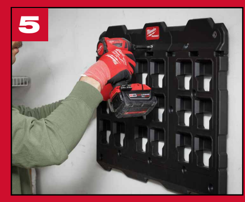
Fasten drywall anchor manufacturer's recommended fasteners into the drywall anchors and #12 x 2" screws into 3/32" pilot holes.