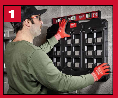
Hold Wall Plate in desired location. Ensure plate is level.