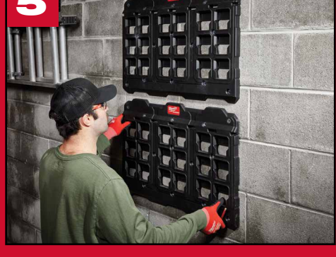
Slide additional Wall Plates into place by guiding the new plate's Quick Alignment Tabs on the top, bottom or sides into place on the first Wall Mounted Plate.