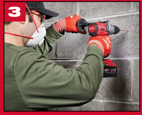
Pre-drill holes with 3/16" masonry bit.