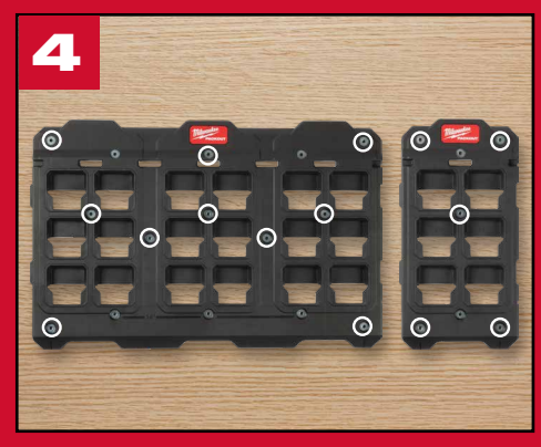
Large Wall Plates require the 10 identified fastening points and Compact Wall Plates require the 5 identified points. Mark these holes with a pencil.