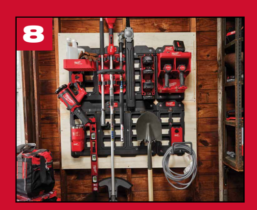
Repeat process to add additional plates and fully customize your shop.